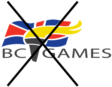
Do not stretch or distort the proportions of the logo.