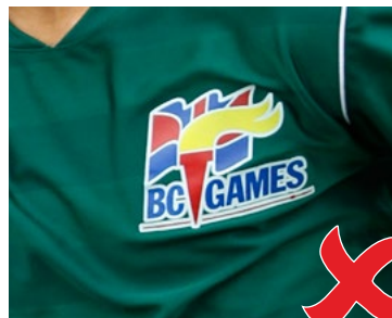
Do not add shadows or outlines to the logo.