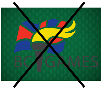
Do not print the logo on a patterned or distracting background.