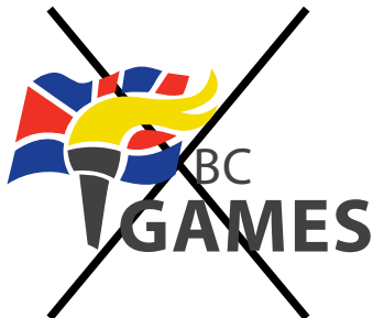
Do not change the font size or any other element of the logo. Do not use parts of the logo or separate any element from the text.