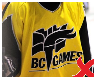
Do not exceed the maximum or minimum size.