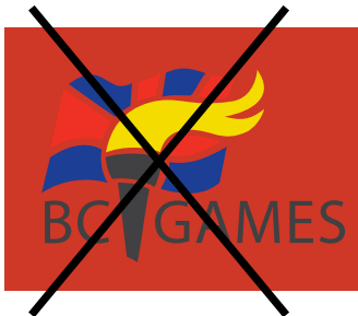
Do not print the full colour logo on a colour that matches or clashes. Use the black, white, or greyscale version.