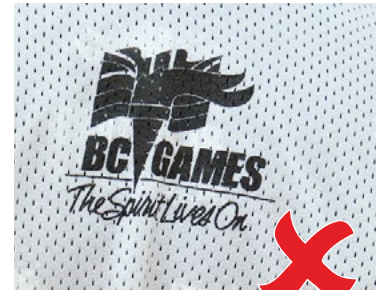
Use the most current version of the logo. Do not use outdated versions of the logo.