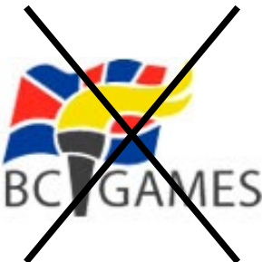
Do not print the logo in a low resolution format.