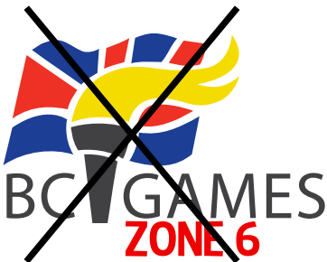
Do not add text to the logo.