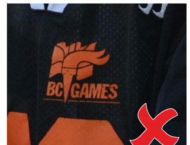
Do not change the colour of the logo.