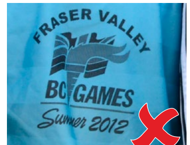
Do not add text to the logo.